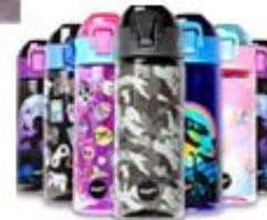
Named Water Bottle