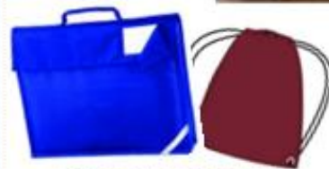
Named book bag and PE bag