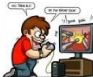
A Parent's Guide to Gaming