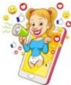
A Parent's Guide to Online Influencers