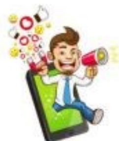
A Parent's Guide to Live Streaming