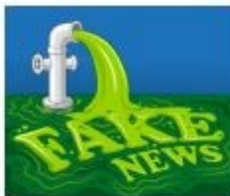
A Parent's Guide to Fake News